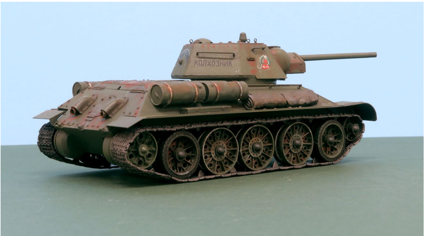
Bart Navarro's 1:35 scale T-34 tank (Tamiya), built OOB, painted with Tamiya acrylics, and weathered with acrylic washes.

At its introduction, the T-34 medium tank possessed an unprecedented combination of firepower, mobility, protection and ruggedness. Its 76.2 mm gun provided a substantial increase in firepower over any of its contemporaries; its heavy sloped armor was difficult to penetrate by most contemporary anti-tank weapons. When first encountering it in 1941, the German tank general von Kleist called it "the finest tank in the world," and Heinz Guderian affirmed the T-34's "vast superiority" over existing German armor of the period. Although its armor and armament were surpassed later in the war, it has often been credited as the most effective, efficient and influential tank design of WW2.